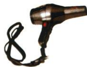
FORE-GL127(HB) AIR DRIER